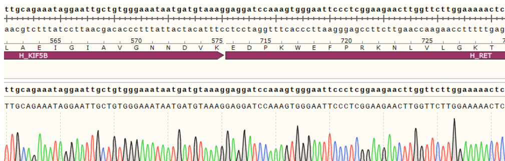
Figure 2 | The KIF5B-RET mutation analysis by Sanger sequencing.